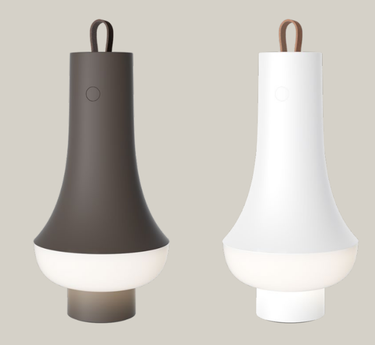
Design by nendo